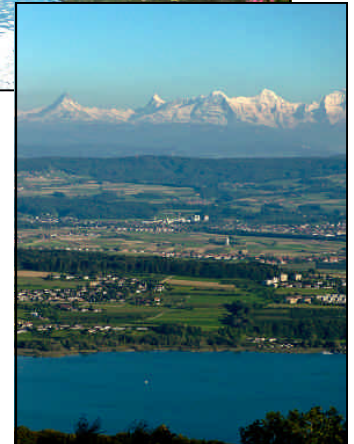
Right: A view of the Alps: the Eiger, Monch, and the Jungfrau