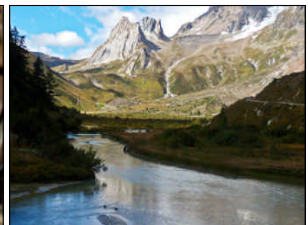
Top: A mountain meadow on the Italian side of Mt. Blanc