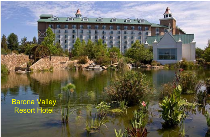
Barona Valley Resort Hotel