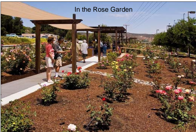
In the Rose Garden