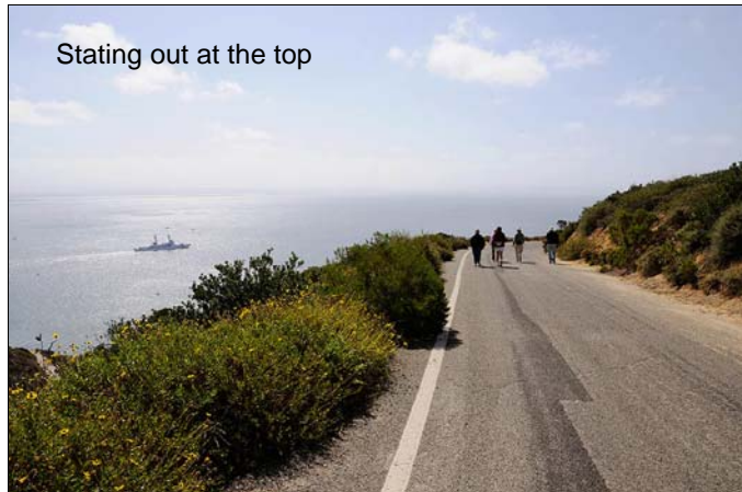
Stating out at the top

Bayside trail hike at the Cabrillo National Monument