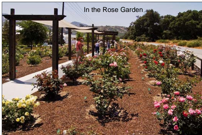
In the Rose Garden