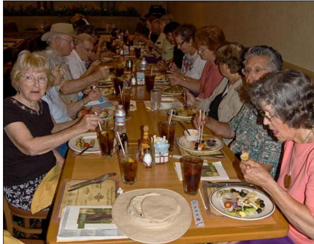
Picture above: Fancy lunch at the Barona Casino following the garden tour