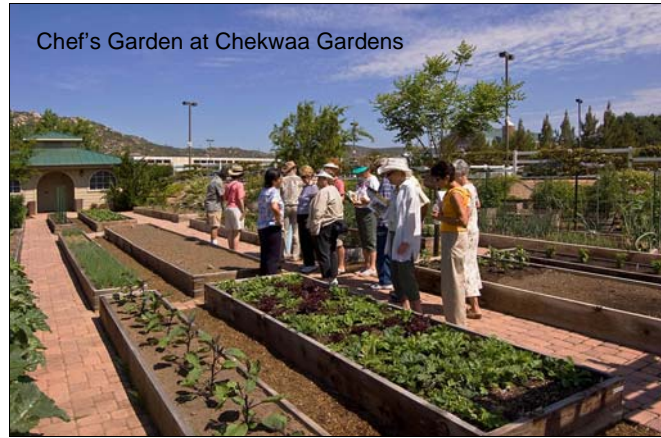
Chef's Garden at Chekwaa Gardens